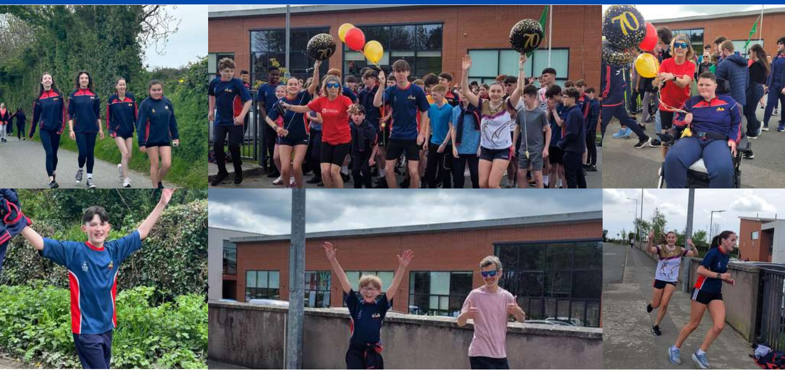
On Friday May 1<sup>st</sup> our students set out to complete a 5km run/ walk to celebrate the schools 70<sup>th</sup> Birthday. Congratulations to all who took part.